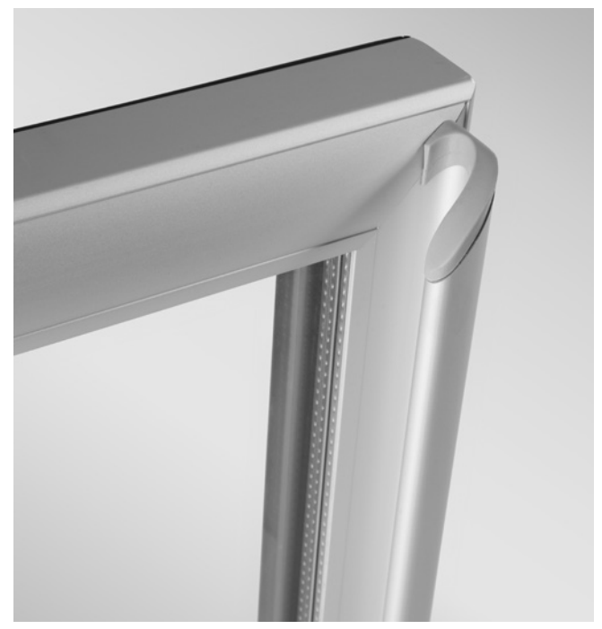
SCHOTT grip Integrated handle