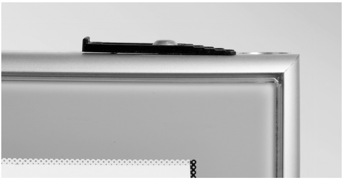
SCHOTT Termofrost® ECO-Clear AGD