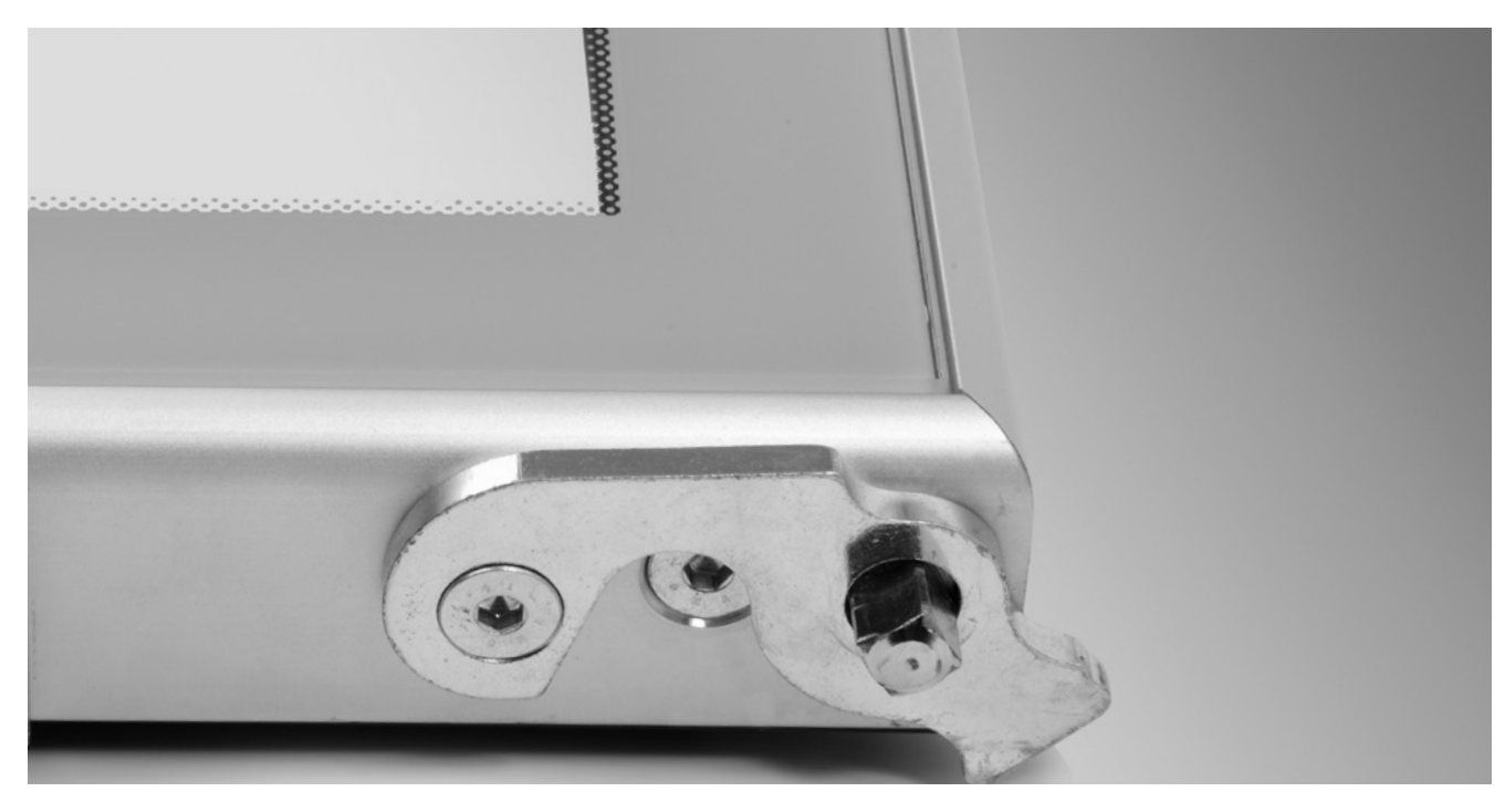
Doors can be used for left or right side mounting