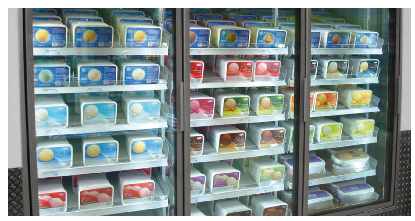
SCHOTT Termofrost® ECO-Clear is equipped with an anti-fog coating to reduce visible condensation