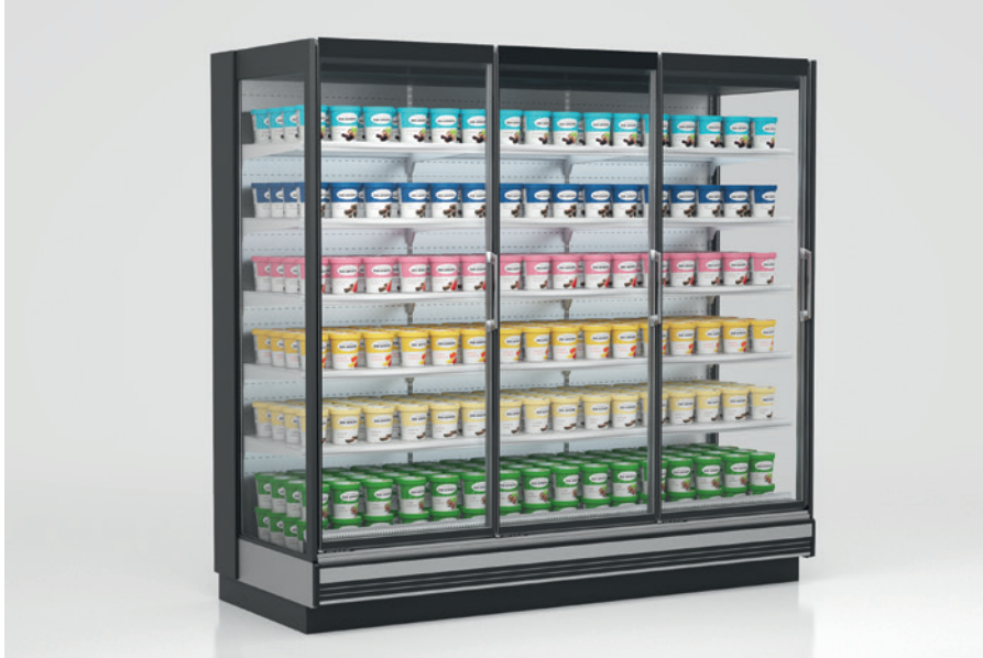
For next generation of multideck freezers: increased transparent display area thanks to a revolutionary slim design

SCHOTT Termofrost® Slimline: Next generation glass door system for freezer cabinets