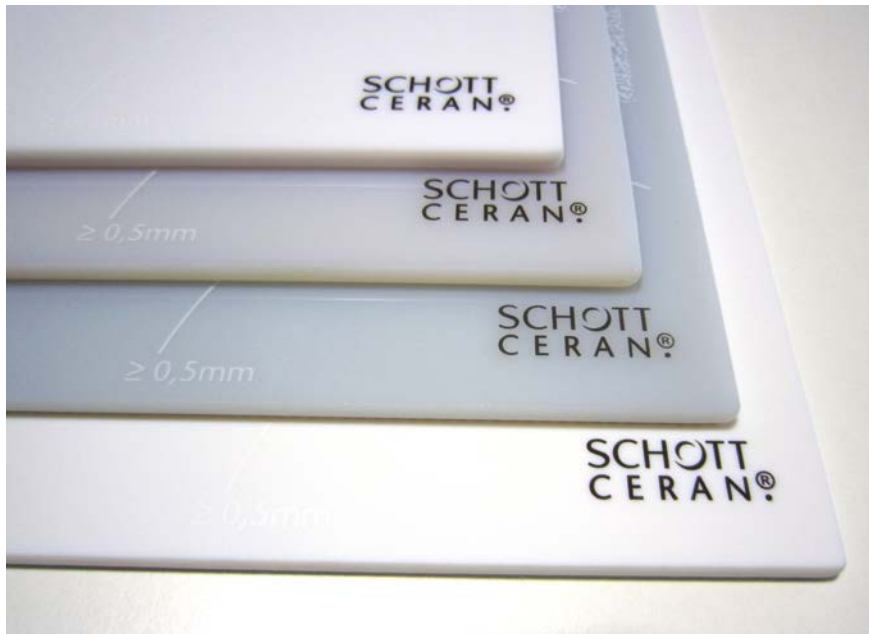
CERAN ARCTICFIRE® classic, CERAN ARCTICFIRE® frost, CERAN ARCTICFIRE® ice, CERAN ARCTICFIRE® snowy (from top to bottom)

SCHOTT offers four different color impressions of white glass-ceramic cooktop panels: CERAN ARCTICFIRE® classic, CERAN ARCTICFIRE® frost, CERAN ARCTICFIRE® ice and CERAN ARCTICFIRE® snowy.