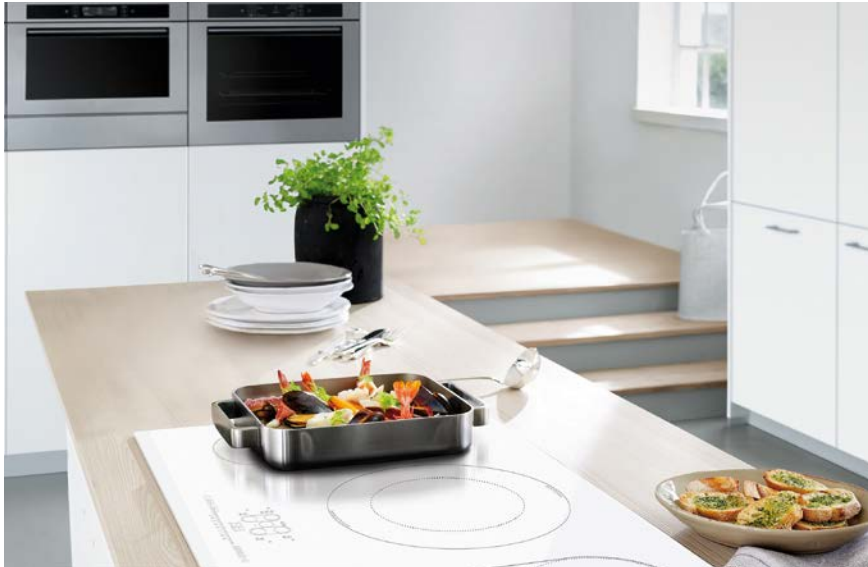
White kitchen design trend

The upper surface of all four white cooktop panels can be printed with designs using the popular decorative colors white, grey, brown, and black. Whether it's the high-contrast black-and-white versions, white-on-white or softer color shades, this set of four white cooktop panels with decorative color accents clearly offers a wide range of design possibilities.