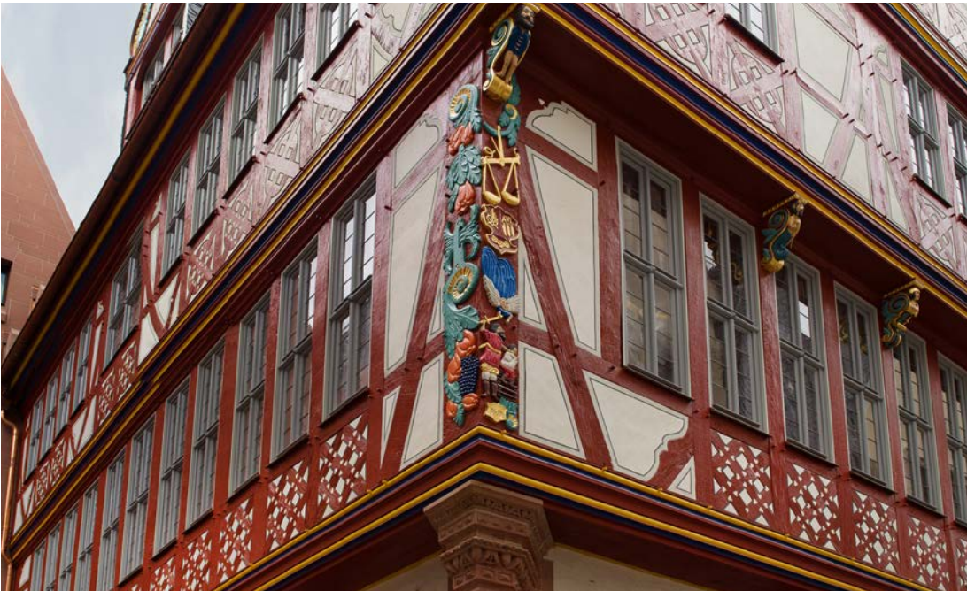
“Goldene Waage” building, Frankfurt am Main, Germany

SCHOTT's Glasses for Restoration are the best choice for the faithful restoration of historical buildings from various eras – mimicking the appearance of the original glazing materials – GOETHEGLAS for buildings from the 18th and 19th centuries, RESTOVER® glass for buildings dating from the early 1900s and TIKANA® glass for buildings from the classical modern period – these glasses also meet any number of contemporary needs because of the wide variety of processing options available, from UV protection to thermal insulation.