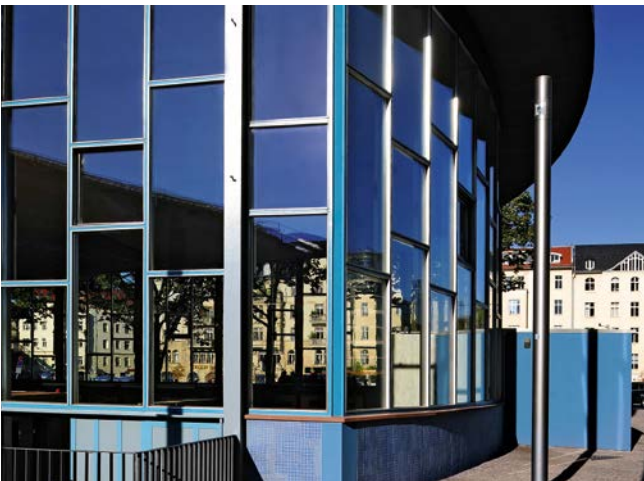
"Palace of Tears", Berlin, Germany

While the surface of RESTOVER® light glass is slightly less irregular, RESTOVER® plus glass has a much more irregular surface structure and resembles mouth-blown glass.