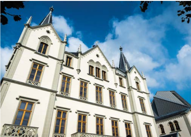
Château de l'Aile, Vevey, Switzerland

GOETHEGLAS is a colorless, drawn glass with the irregular surface characteristic of window glass common to the 18th and 19th centuries. It can also be used to protect precious, leaded glazing from the elements and other adverse environmental conditions.