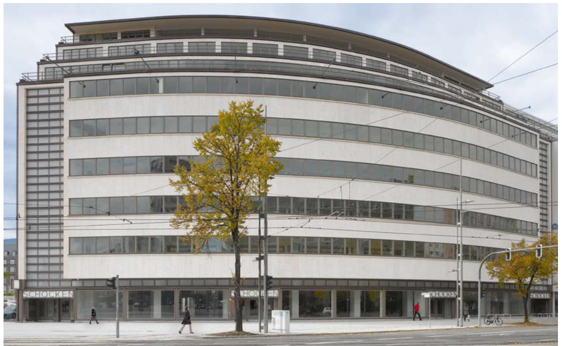
Schocken department store, Chemnitz, Germany