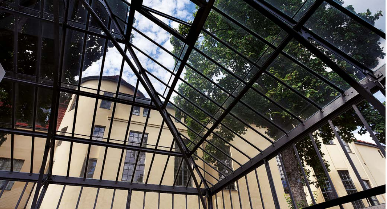
Bauhaus-University Weimar – The Brendel Studio using SCHOTT RESTOVER® laminated glass.