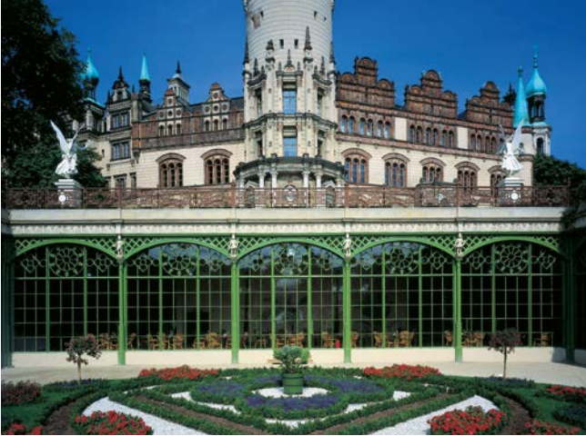
Orangery Schwerin Castle, Schwerin, Germany