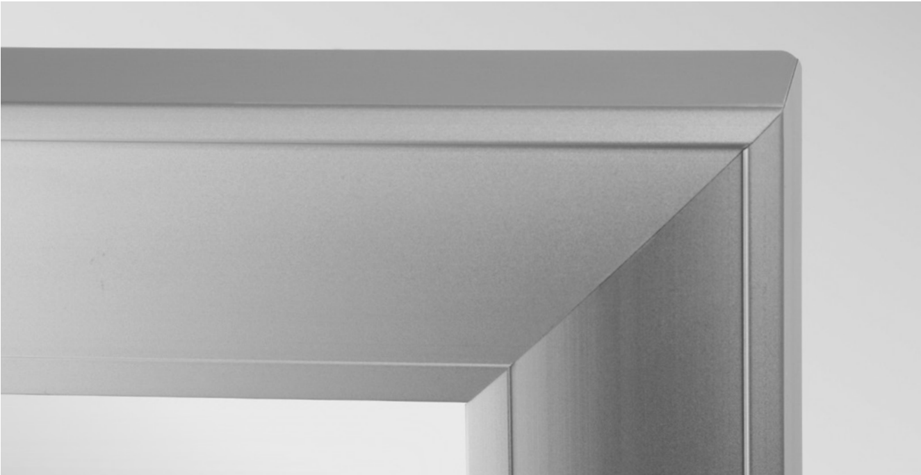
SCHOTT Termofrost® ECO-Clear X