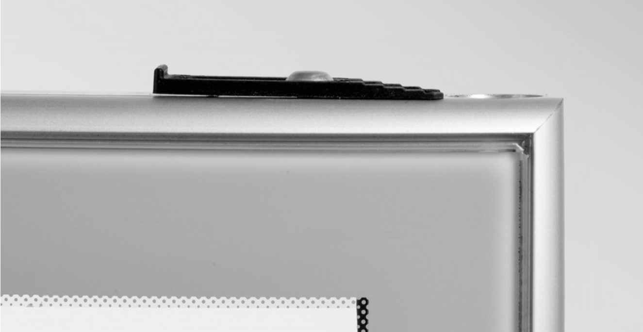
SCHOTT Termofrost® ECO-Clear AGD