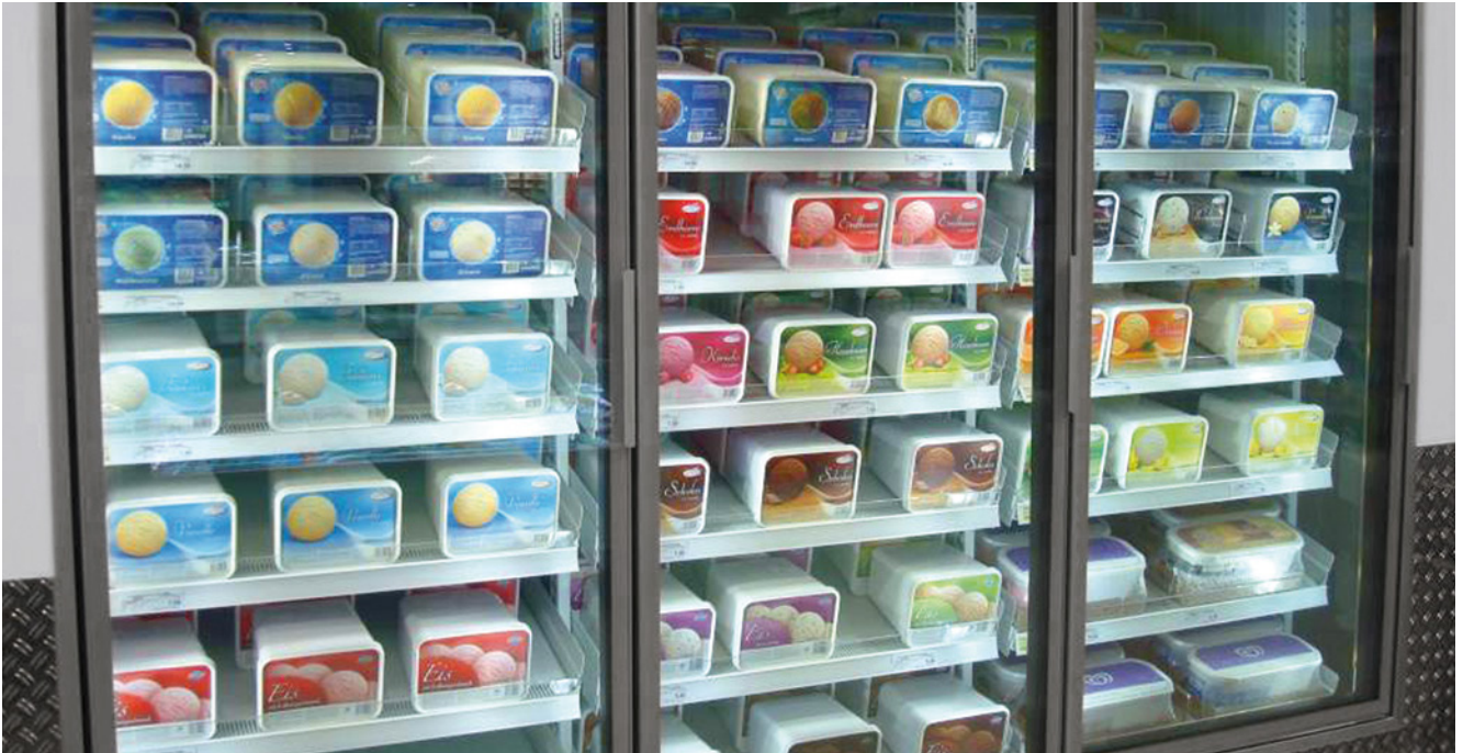
SCHOTT Termofrost® ECO-Clear is equipped with an anti-fog coating to reduce visible condensation