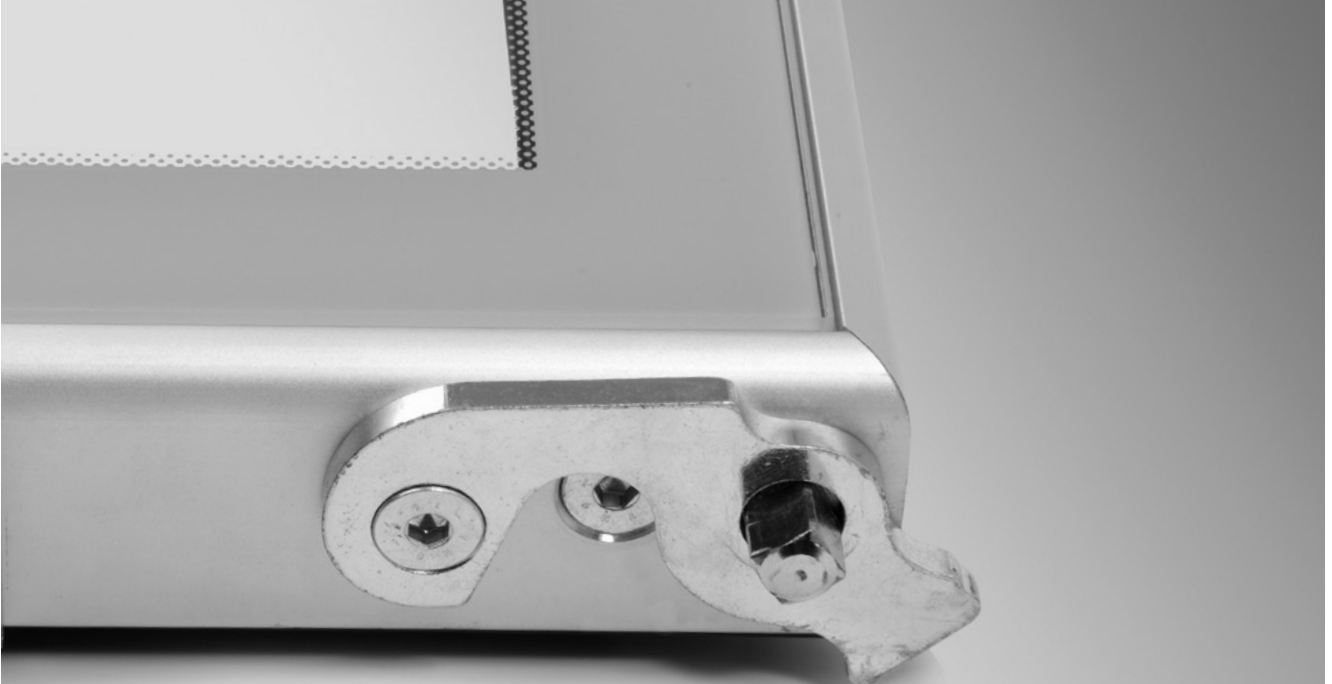
Doors can be used for left or right side mounting