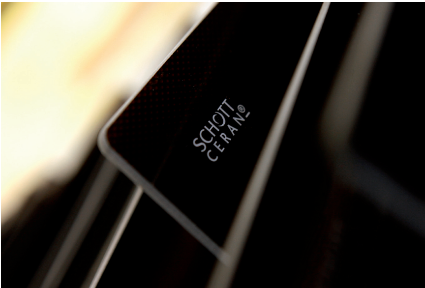
SCHOTT CERAN® – simply unmatched!

Our glass-ceramic is known for its outstanding chemical and physical properties. SCHOTT CERAN® is extremely durable and incredibly tough. Thanks to our quality, we even exceed industry standards. SCHOTT CERAN® is simply unmatched when it comes to its thermal and mechanical characteristics. But where does this quality come from? Quite simply, it is the combination of the manufacturing process, our unique processing technology and the original formula used to make SCHOTT CERAN®.