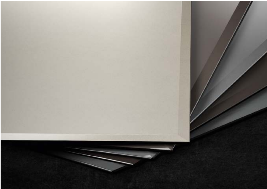
Multiple design possibilities through various colors and textures