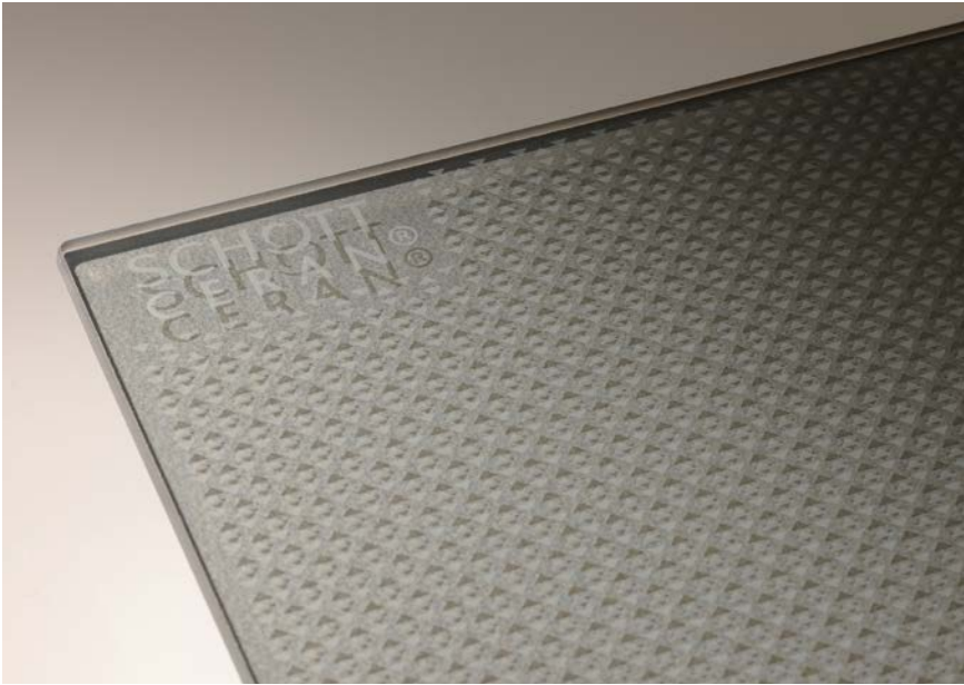
CLEAR aida grey

CERAN CLEARTRANS® is a transparent glass-ceramic without nubs on the underside. It has a coloring underside print that can be combined with additional topside decoration colors. This offers a completely new dimension of designs and user functions. CERAN CLEARTRANS® is specifically developed for induction heating.