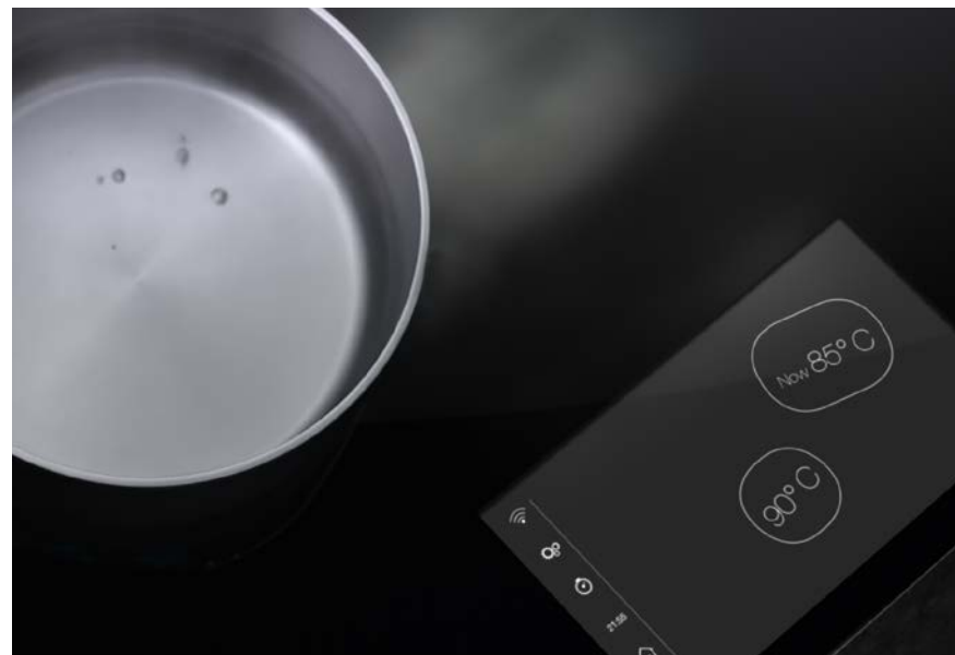
CERAN CLEARTRANS® with high resolution display