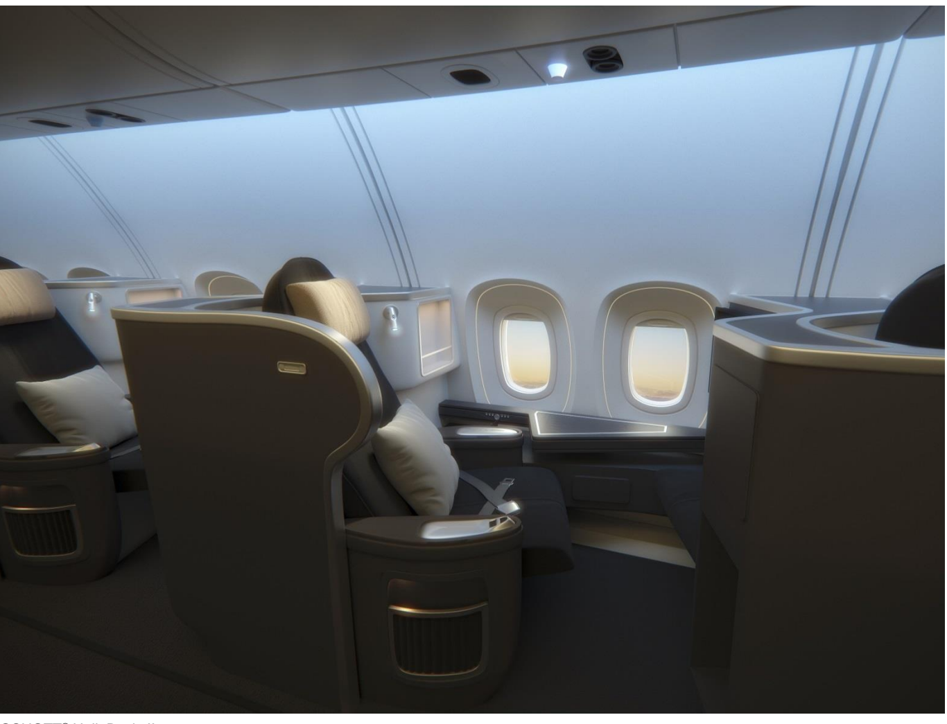
SCHOTT® HelioBasic II

Small and light LED light source in various colors