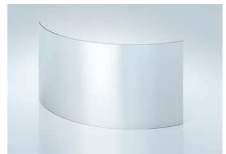
Curved ROBAX® glass-ceramic panel

The ROBAX® Architecture Line is a defined portfolio of standard geometries perfectly suited for custom fireplace designers and installers (e.g. for hotels, restaurants, other public places and private rooms).