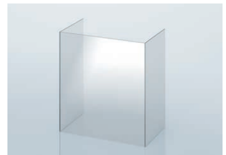
ROBAX® glass-ceramic panel | Angular bent, 2 angles