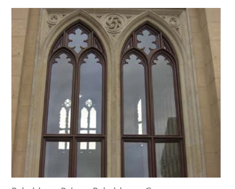
Babelsberg Palace, Babelsberg, Germany