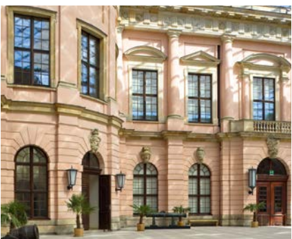
German Historical Museum, Berlin, Germany