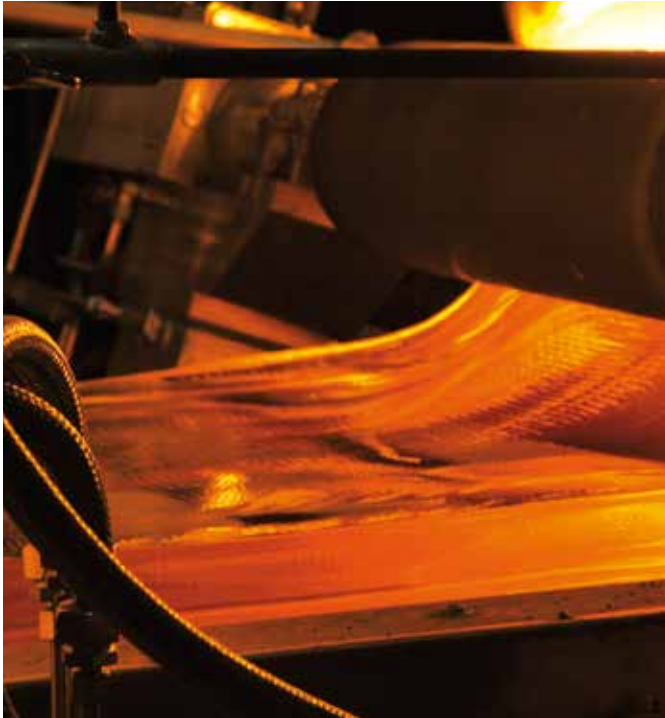
SUPREMAX® 33 ultra thick borosilicate glass.

SUPREMAX® 33 is a rolled borosilicate glass available in sheet form with a chemical composition identical to SCHOTT's floated borosilicate glass BOROFLOAT® 33.