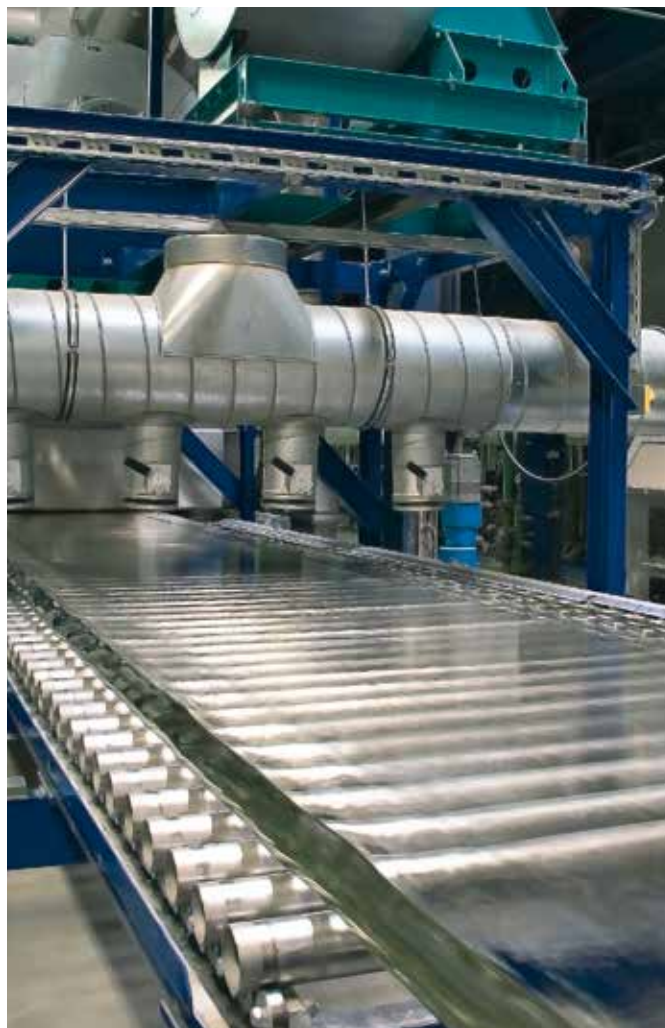
SUPREMAX® 33 is available in large sheet sizes.