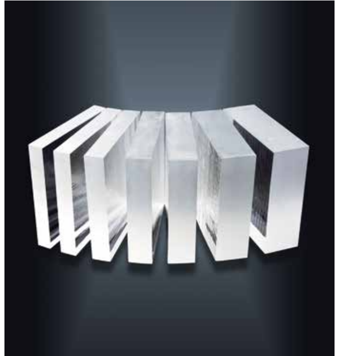
SUPREMAX® 33 is available in a broad thickness range.

The outstanding physical and chemical properties of SUPREMAX® 33 offer the benefits of low thermal expansion, high thermal resistance, excellent light transmission and impressive chemical durability. SUPREMAX® 33 is also a low density glass that is 12 % lighter than soda lime glass. This, in combination with the availability of a broad thickness range (up to 57.2 mm), makes SUPREMAX® 33 a highly versatile material suitable for an unlimited array of applications.