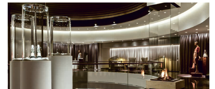
Product presentation: Qela Store, Qatar