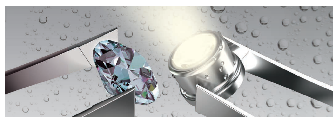
Ultra small, ultra robust, ultra brilliant: SCHOTT Solidur® Mini LED

The world's smallest fully autoclavable family of HB LEDs for Medical and Dental Devices