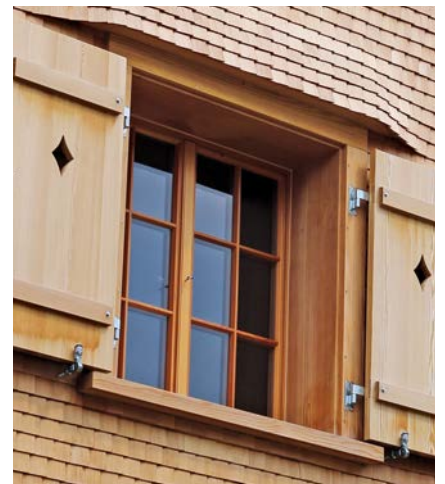
SCHOTT RESTOVER® windows, oiled larch wood frame