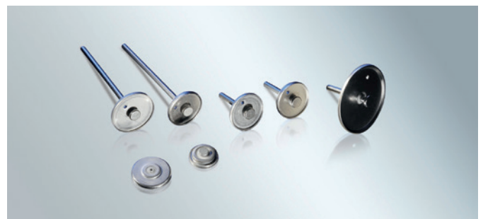
Standard glass-to-metal seals for millions of Lithium-Thionyl Batteries

A preferred solution typically used for electronic or electrochemical components is the sealing of pins with inorganic, non-aging materials like glass. This is commonly called a Glass-to-Metal Seal (GTMS) and is used in combination with materials like steel, kovar and others. Glass-to-metal sealing is a standard packaging technology for many mass market components like automotive sensors, quartz oscillators and battery caps for Lithium-Thionyl Batteries.