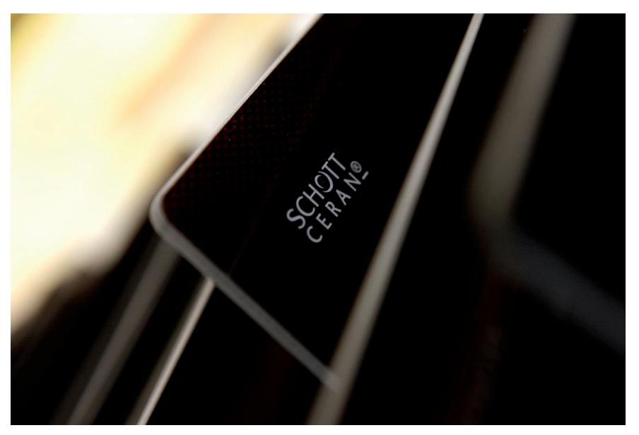
SCHOTT CERAN® - simply unmatched!

Our glass-ceramic is known for its outstanding chemical and physical properties. SCHOTT CERAN<sup>®</sup> is extremely durable and incredibly tough. Thanks to our quality, we even exceed industry standards. SCHOTT CERAN<sup>®</sup> is simply unmatched when it comes to its thermal and mechanical characteristics. But where does this quality come from? Quite simply, it is the combination of the manufacturing process, our unique processing technology and the original formula used to make SCHOTT CERAN<sup>®</sup>.