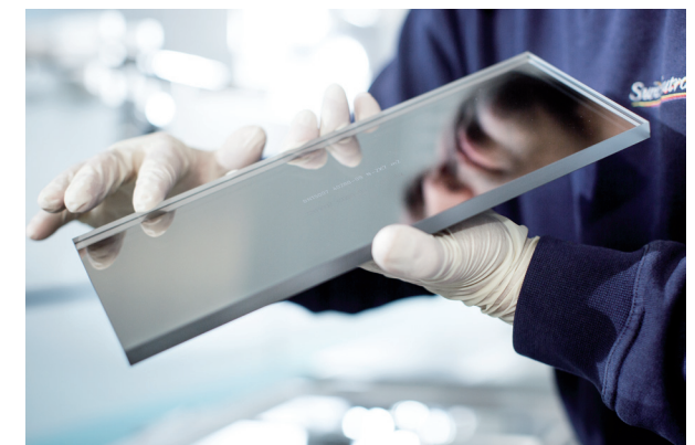
pic_06: Nano-thin reflecting surface during final visual inspection

Editorial use of the photos permitted for this project report only. Please note the photo credits.