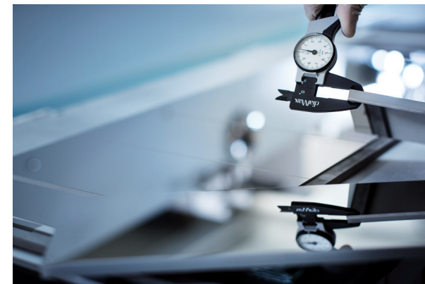
pic_03: Measurement in the micrometer range