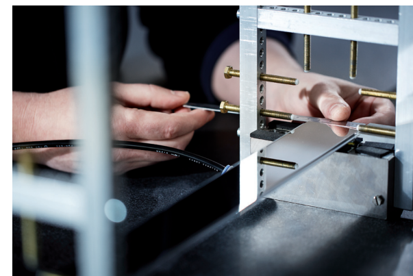
pic_05: Even today precision still requires good manual labor