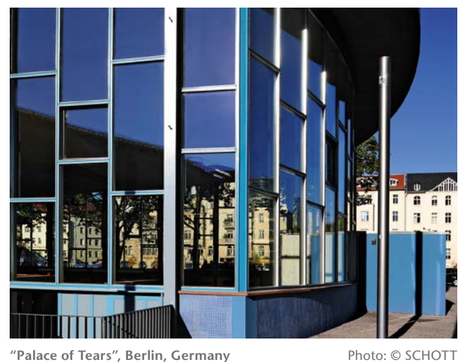
"Palace of Tears", Berlin, Germany

While the surface of RESTOVER® light glass is slightly less irregular, RESTOVER® plus glass has a much more irregular surface structure and resembles mouth-blown glass.