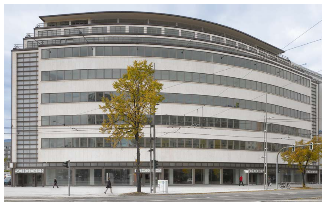
Schocken department store, Chemnitz, Germany