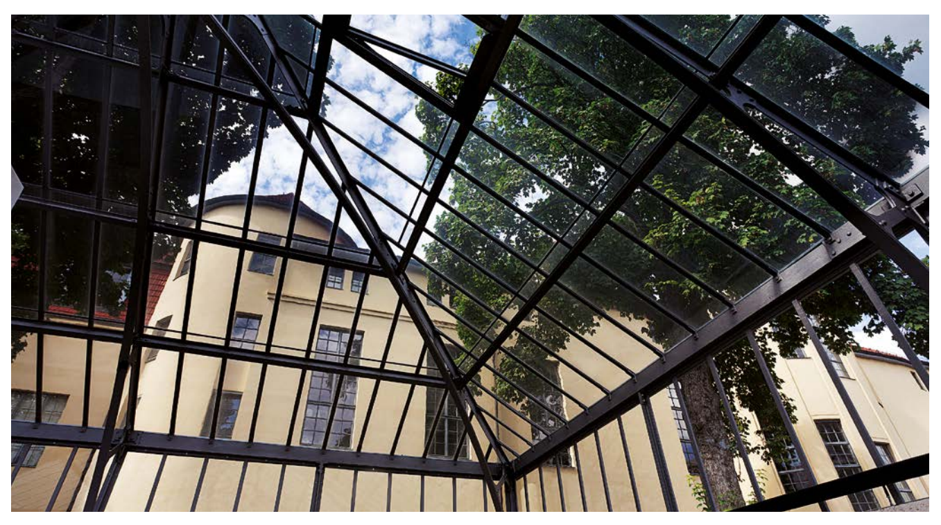
Bauhaus-University Weimar – The Brendel Studio using SCHOTT RESTOVER® laminated glass.