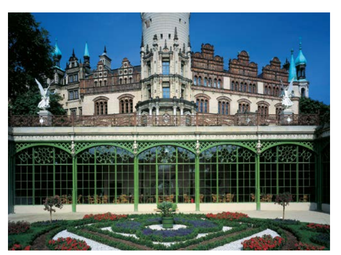
Orangery Schwerin Castle, Schwerin, Germany