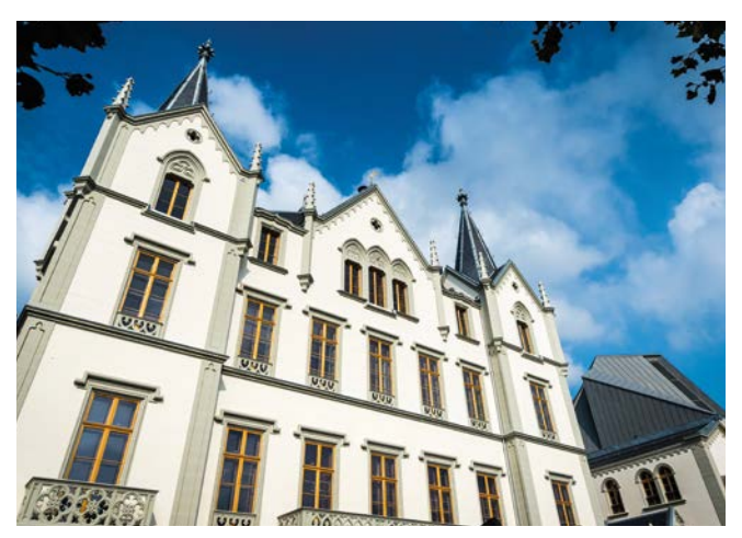
Château de l'Aile, Vevey, Switzerland

GOETHEGLAS is a colorless, drawn glass with the irregular surface characteristic of window glass common to the 18th and 19th centuries. It can also be used to protect precious, leaded glazing from the elements and other adverse environmental conditions.