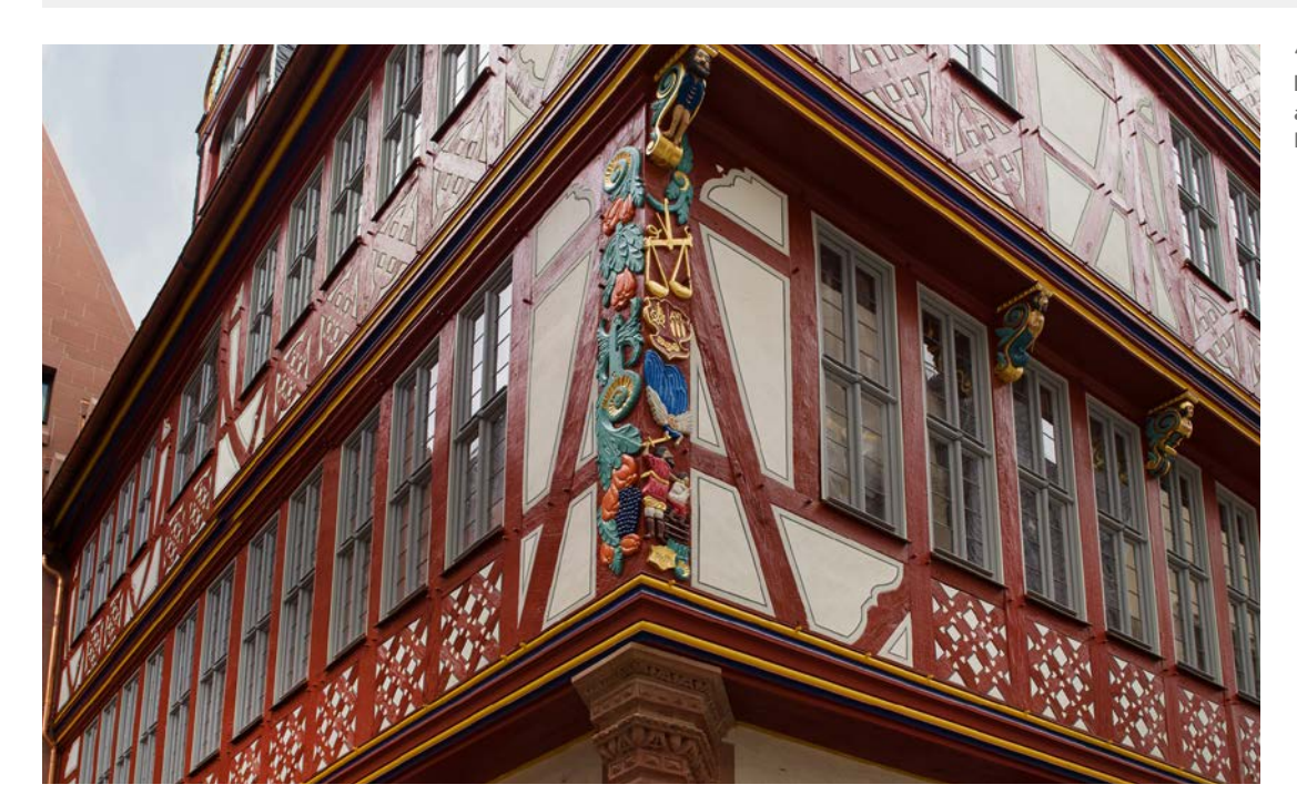
"Goldene Waage" building, Frankfurt am Main, Germany

SCHOTT's Glasses for Restoration are the best choice for the faithful restoration of historical buildings from various eras – mimicking the appearance of the original glazing materials – GOETHEGLAS for buildings from the 18th and 19th centuries, RESTOVER® glass for buildings dating from the early 1900s and TIKANA® glass for buildings from the classical modern period – these glasses also meet any number of contemporary needs because of the wide variety of processing options available, from UV protection to thermal insulation.