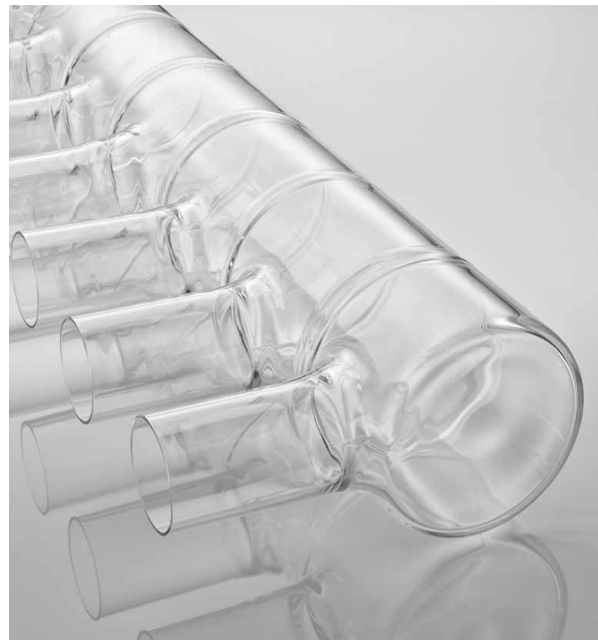
Manifold with closed end