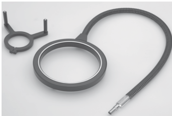
Annular ringlight Maxi 150 mm