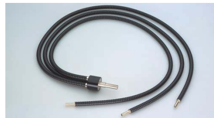
Flexible light guide 3 branch