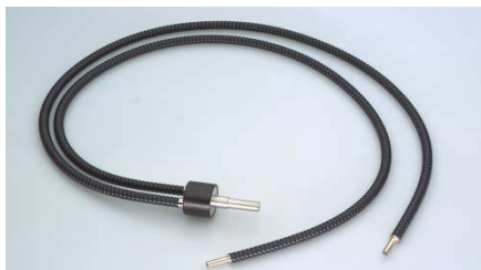
Flexible light guide 2 branch