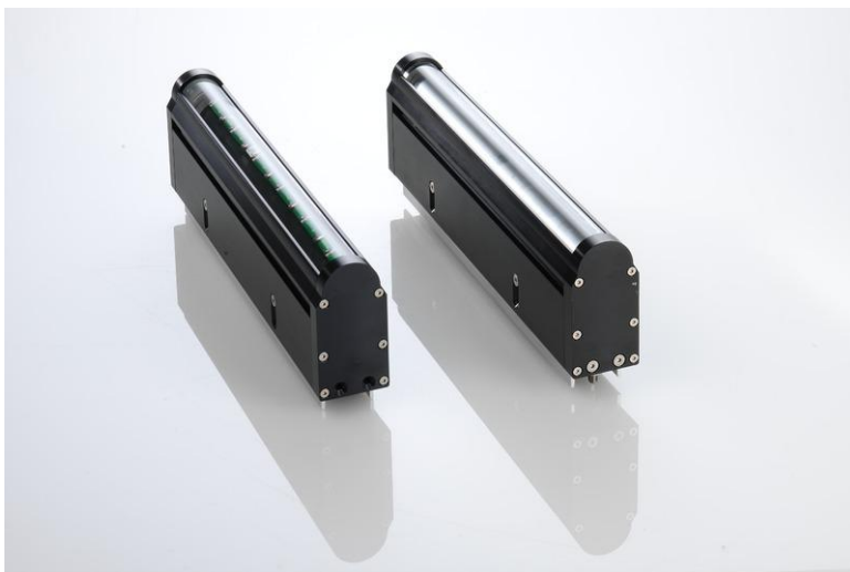
Lightline without focus adjustment tool

The focus adjustment bracket is removable.