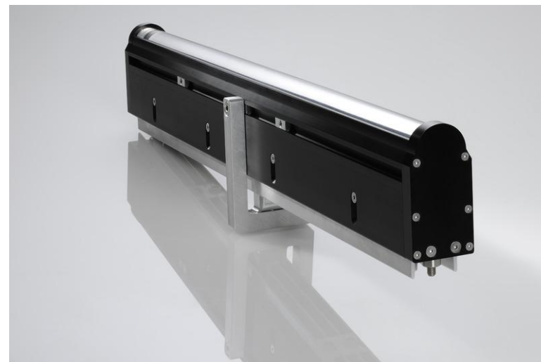
Lightline with focus adjustment tool