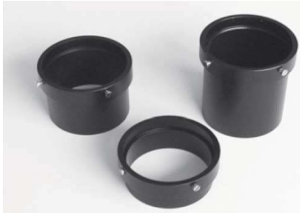
Extension adaptors for darkfield ringlight