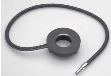
Annular darkfield ringlight 66/70 mm