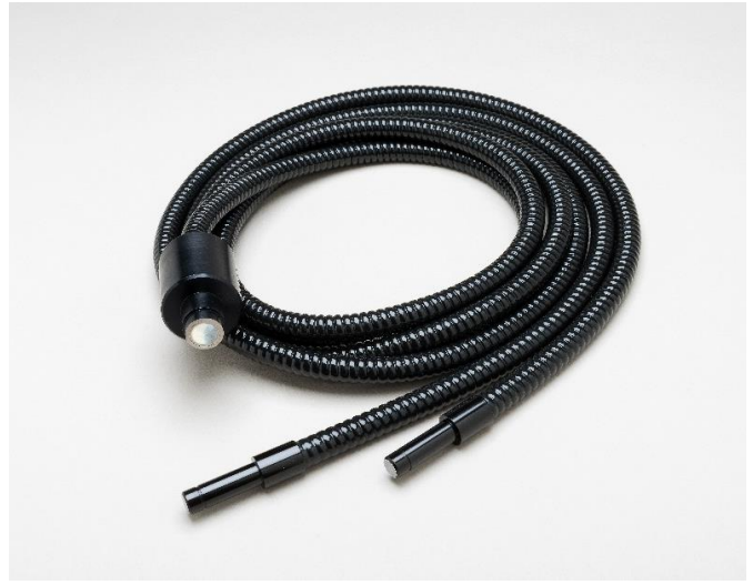
Dual Bundle, A08550.72

Bundle Input: Black Anodized Aluminium Bundle Sheathing: PVC Covered Metal Tubing