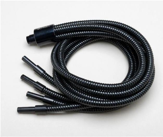
Quad Bundle, A08545

Flexible bundles give the user versatility when routing and positioning light.