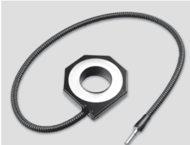
Diffusing Ringlight 66 mm