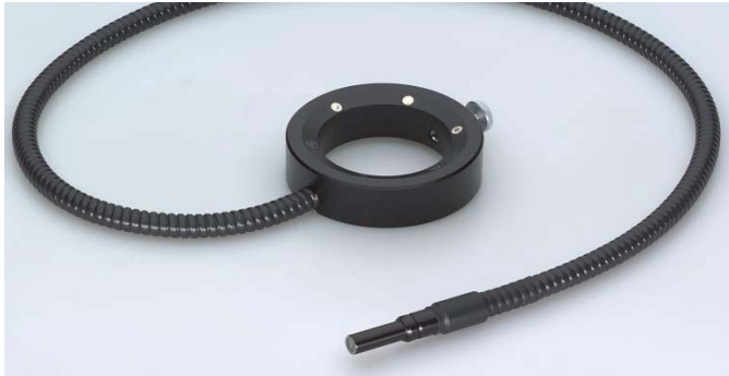
6-point ringlight 58 mm