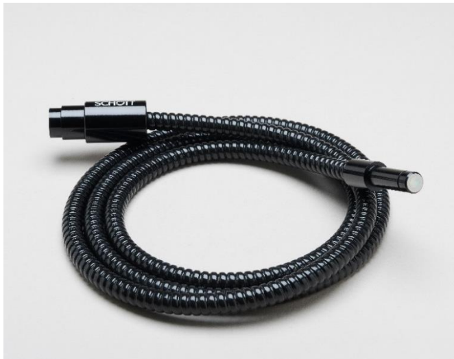
Single Bundle, A08020.60

Flexible bundles give the user versatility when routing and positioning light.