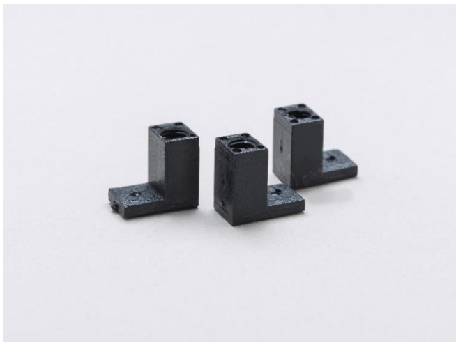
Anti-Slip Ringlight Clamps, A08614