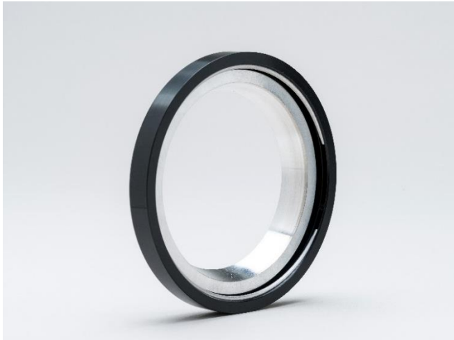
Reflector Ring, A08616