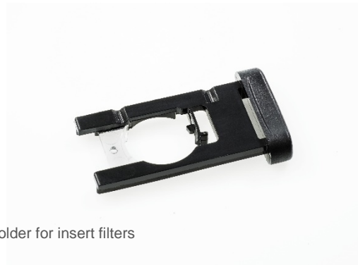
Filter Holder for insert filters