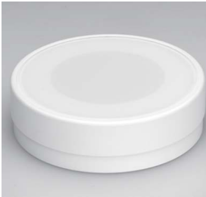
Transmitted light stage, P/N 122 150