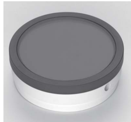
Transmitted light stage P/N 122 150 with Polarization filter P/N 158 500