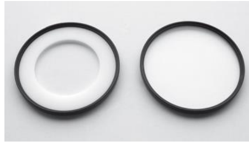
Diffusor and protection window for ringlight