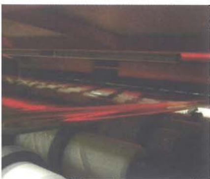
PYRAN PLATINUM GLASS-CERAMIC SHOWN IN PRODUCTION.

Water conservation has been a major focus at SCHOTT's manufacturing site. To underscore this focus, Schott provided a water balance and flow diagram to MBDC showing all water usage and wastewater streams. SCHOTT already uses grey-water for 90 percent of the total water need at its manufacturing site. Freshwater is used only for drinking water and sensitive manufacturing