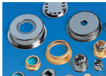
Application: TO Caps

The new N-LaSF46B ball lens has a high refractive index and hence, better coupling efficiency and shorter focal length. These advantages help to reduce the power requirements and overall size of the optical sub-assembly.