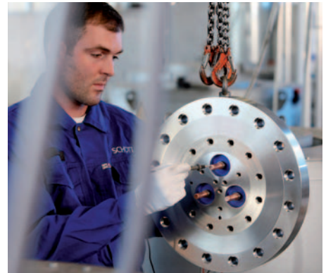
Testing of large-scale electrical feedthrough used for LNG vessels