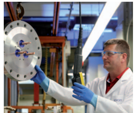
Plating of large-scale electrical feedthrough for LNG vessels

For more information: www.schott.com/epackaging