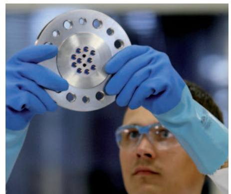
Visual inspection of feedthrough used for LNG vessels