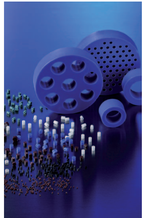
Various sizes and designs of sintered glass performs