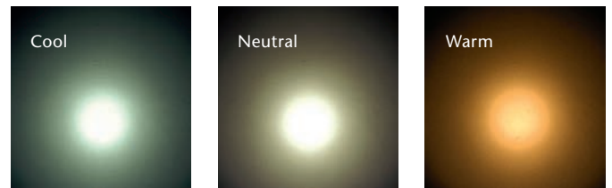
Customized white light and color temperature