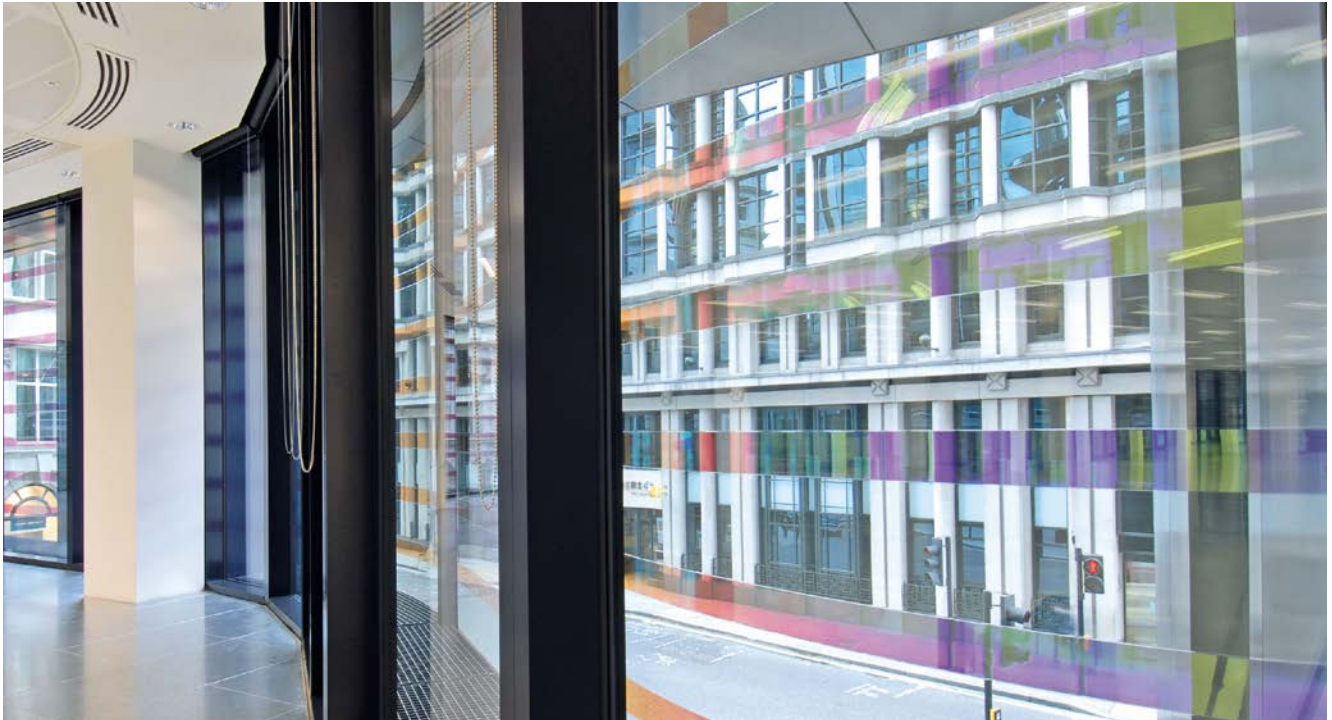
Fascinating view: NARIMA® used in the "60 Threadneedle Street" office building in London Architect: Eric Parry Architects