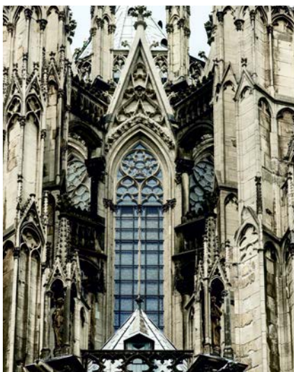
SCHOTT AMIRAN ^{\circledR} Heritage Protect

In the spring of 2018, the first upper choir windows in the Cologne Cathedral were fitted with the new SCHOTT AMIRAN ^{\circledR} Heritage Protect glazing. More windows are to follow.