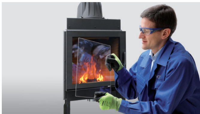
Fire viewing panels with heat-reflective coating IR Max