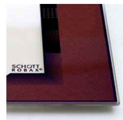
metallic red and mystic black