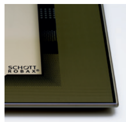
matte stone grey and mystic black