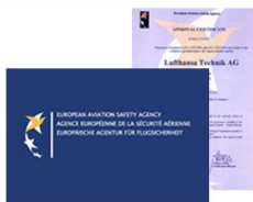
EASA approved STC for installation of HelioJet (white) in A319-A320-A321