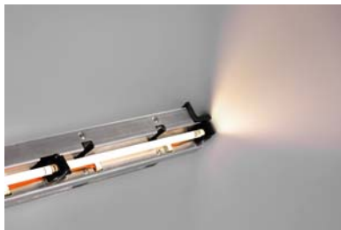
Picture ID 132129: HelioJet is a flexible, modular concept which uses all the advantages of fluorescent tubes and LED technology.

Download link to a ZIP file that contains this photograph in print quality: