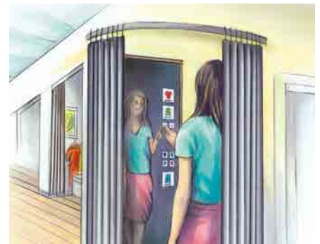
Lighter surroundings behind the glass pane: The display becomes visible and usable.