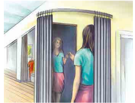
Strong light in the changing room: SCHOTT MIRONA® is an elegant silver shimmering mirror – despite a reflectance of only 34%.

Are these trousers available in a smaller size? Is this top available in other colours? Which jacket can I combine the jeans I'm just trying on with? The digital sales-assistant is there to answer these questions. And if a product is not in stock, it can be ordered directly via touch display and delivered either to the shop or a customer's home address. The ideal way to combine the strengths of physical retail with the comfort of online shopping.