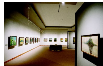
SCHOTT MIROGARD® for art in museums and galleries