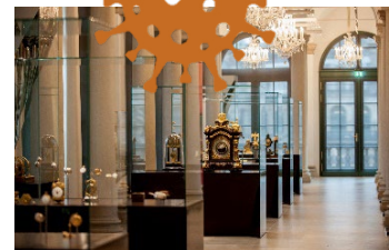
SCHOTT AMIRAN® for showcases in museums