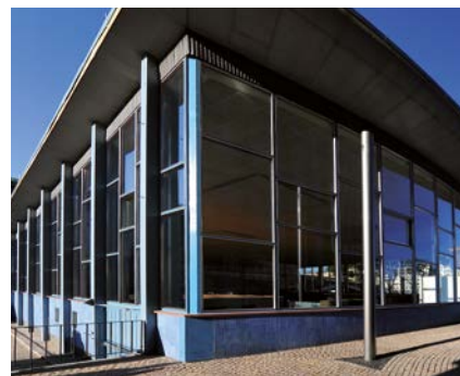
Palace of Tears, Berlin, Germany