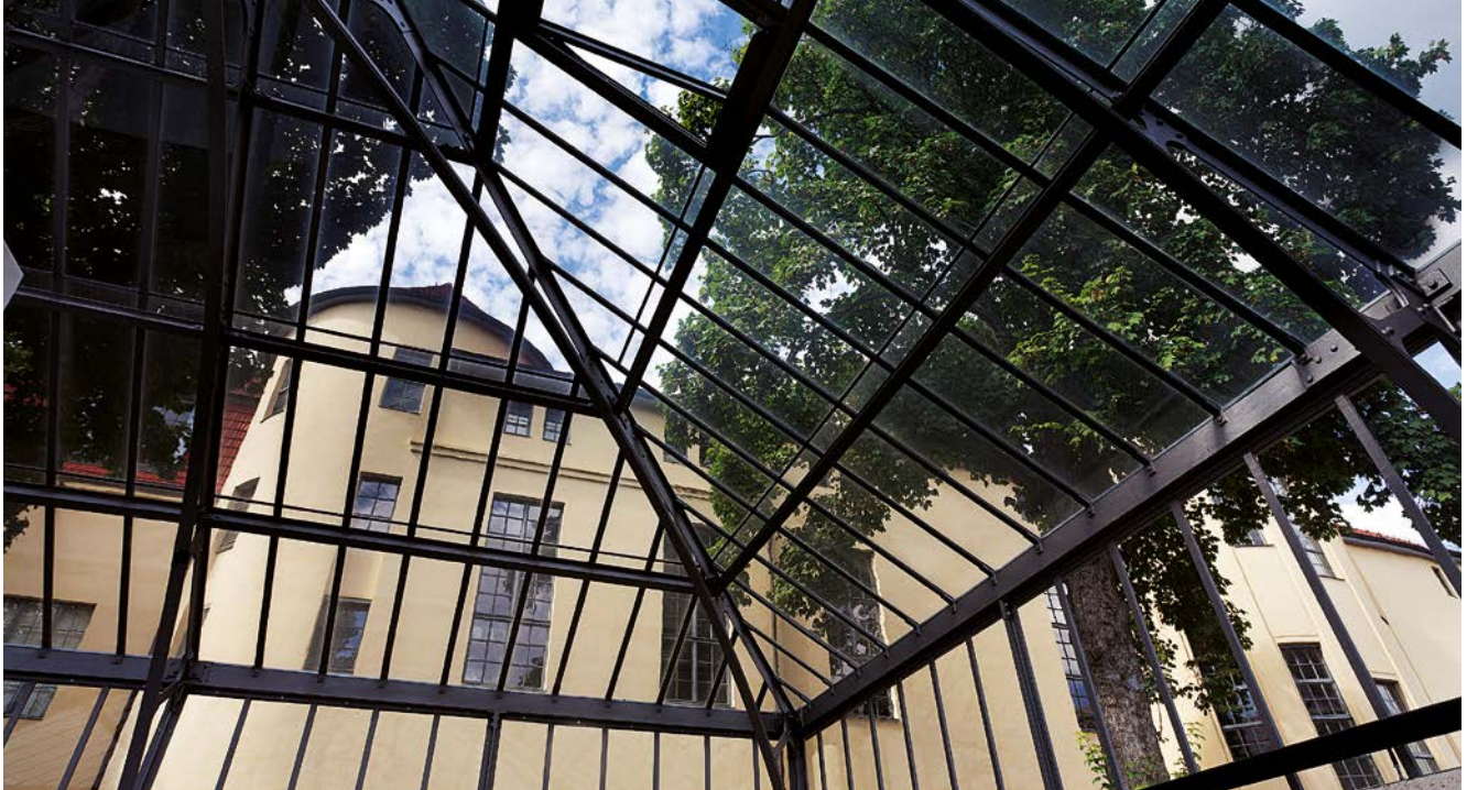
Bauhaus-University Weimar – The Brendel Studio using SCHOTT RESTOVER® laminated glass.