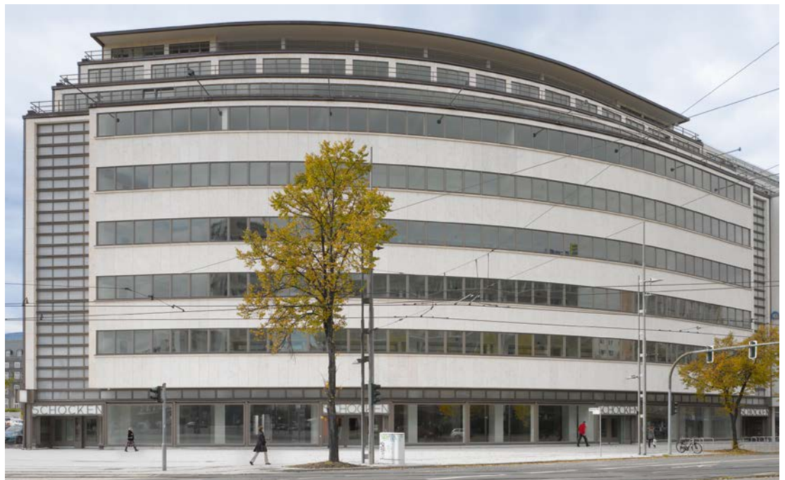
Schocken department store, Chemnitz, Germany