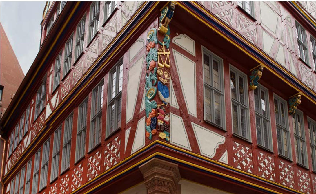
“Goldene Waage” building, Frankfurt am Main, Germany

SCHOTT's Glasses for Restoration are the best choice for the faithful restoration of historical buildings from various eras – mimicking the appearance of the original glazing materials – GOETHEGLAS for buildings from the 18th and 19th centuries, RESTOVER® glass for buildings dating from the early 1900s and TIKANA® glass for buildings from the classical modern period – these glasses also meet any number of contemporary needs because of the wide variety of processing options available, from UV protection to thermal insulation.