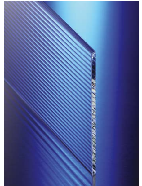
The fine structured decorative glass SCHOTT RIVULETTA® opens up new design possibilities.

Straight and purist in form, elegant in its look and feel: thin, parallel flutes running along one side give RIVULETTA® its timeless, classical beauty. A design which is wholly created from the material itself. In contrast to it, the flat back side that underscores the brilliance of its overall impression with its likewise fire-polished surface.