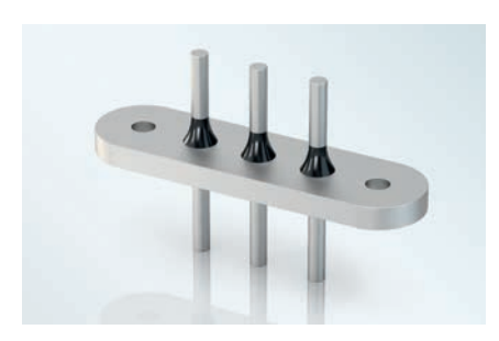
Extended sealing glass insulation