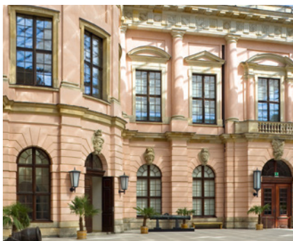
German Historical Museum, Berlin, Germany