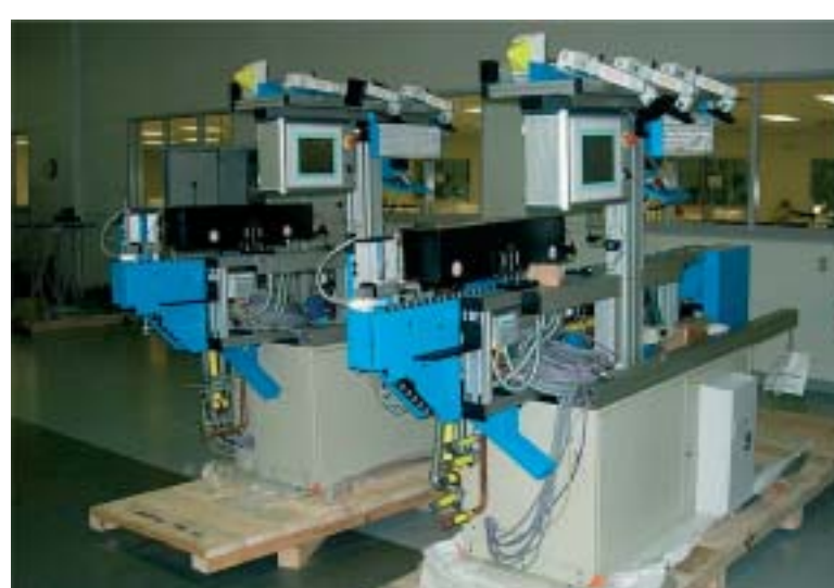
Ongoing upgrading of production will increase quality and productivity.