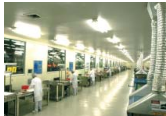
Customers were impressed by the manufacturing facility

invested more than $20 million to maintain the highest standards of quality for a growing market. "We are the largest manufacturing site for primary pharmaceutical packaging in Southeast Asia with a production capacity of approximately 800 million vials, ampoules and dropper pipettes per year," says