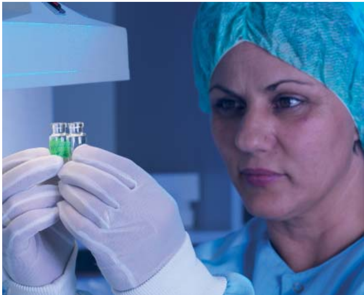
Biotech drugs present new challenges for primary packaging.