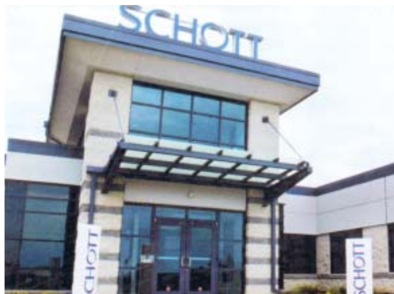
SCHOTT forma vitrum site in Lebanon, Pennsylvania.

Only three years old, the pharmaceutical packaging facility for SCHOTT forma vitrum in Lebanon, Pennsylvania, is already upgrading in order to meet customer needs in a growing market.