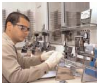
Quality inspection at SCHOTT forma vitrum in Brazil.

Commitment to quality improvement has been part of the culture at the SCHOTT Sao Paulo facility from the beginning: a scant year after it was commissioned in 2001, Six Sigma was implemented with a "champion," two "black belt" project leaders and a passion for