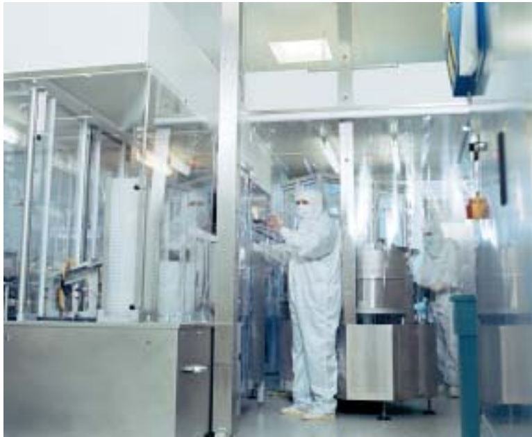
Latest technology and expanded capacity at the syringe production in Switzerland.

"With the new, state-of-the-art syringe production facilities, we will expand our manufacturing capacity and improve our prod-