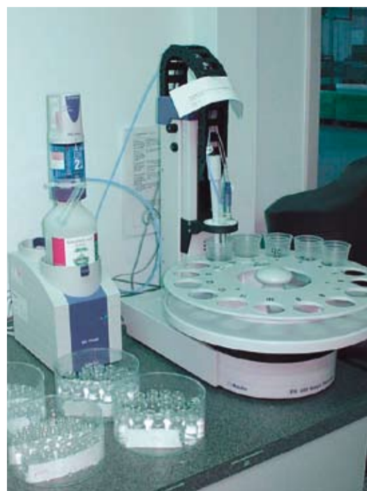
The test for hydrolytic surface resistance for primary glass containers has been a standard at SCHOTT forma vitrum for well over a decade.

Manufacturers of pharmaceutical packaging delivering to the US or under USP mandate will have to challenge their process and process control, according to Gruening. "Some might have to go through a certain learning curve in the beginning as we have seen in Western Europe, but