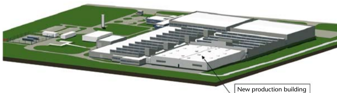
New production building

A new building with 3,500 m 2 of floor space was constructed for vial production in Lukásháza, Hungary.