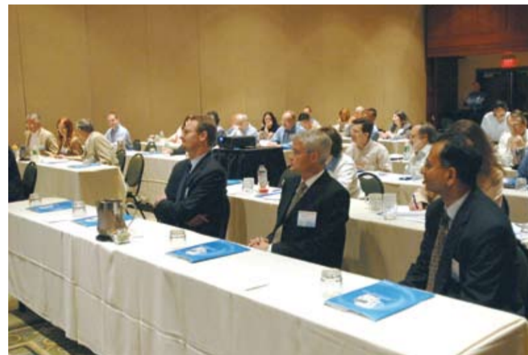
Some 120 representatives from more than 50 companies joined the workshops.

Extractables and leachables, regulations and quality.