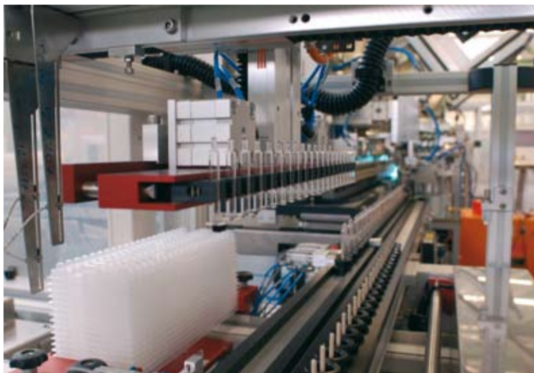
The new machine is completely integrated in the manufacturing process.

ticularly with regard to free needle length and needle angle. In addition the assembly line is equipped with a new generation camera inspection system. Reducing tolerances from the norm by half will be