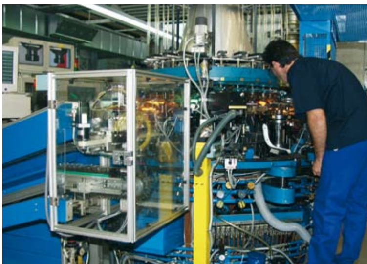
Production machines in Hungary are being overhauled and adjusted to ensure uniform manufacturing processes worldwide.

SCHOTT forma vitrum has been working on these topics for a number of years. Already today, many products can be offered in the same quality from more than one manufacturing site. However,