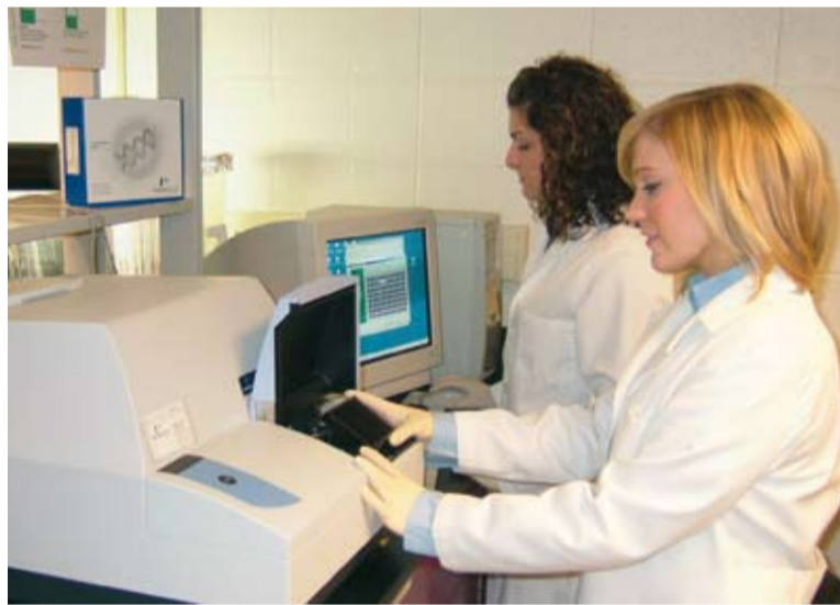
Engineers testing protein adsorption to pharma containers.

"We're very action/result oriented," says Conzone, "with 50-60% of our time focused on short term development and technical support and 40% on futuristic R&D. For example, our biotechnology group has recently developed advanced, high sensitivity microarraying platforms that are now being considered for use in bioterrorism agent